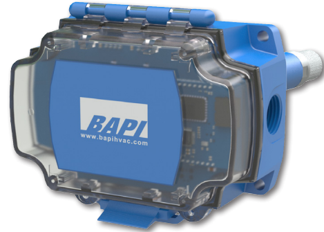
Wireless Duct Temperature and Humidity Sensor

BAPI's Wireless Duct Temperature and Humidity 900 MHz Sensor features a rugged IP66-rated BAPI-Box enclosure.