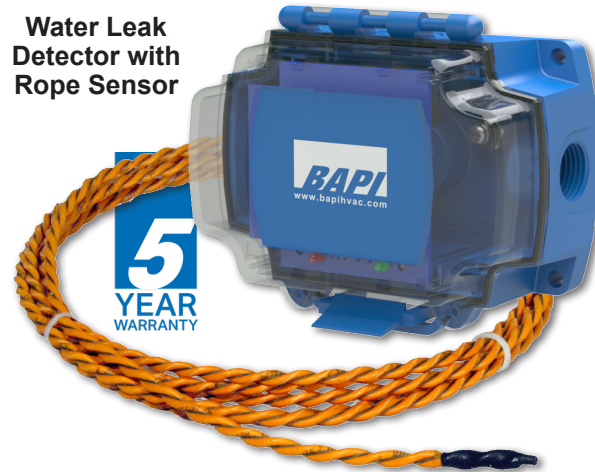
Water Leak Detector with Rope Sensor

The Water Leak Detector is designed to sense the presence of water and alert a central monitoring system of the potentially destructive situation. Upon water detection, the alarm output relays change state, and a local red LED illuminates. The sensor detects dirty and purified water, deionized water, distilled water and reverse osmosis (RO) water.