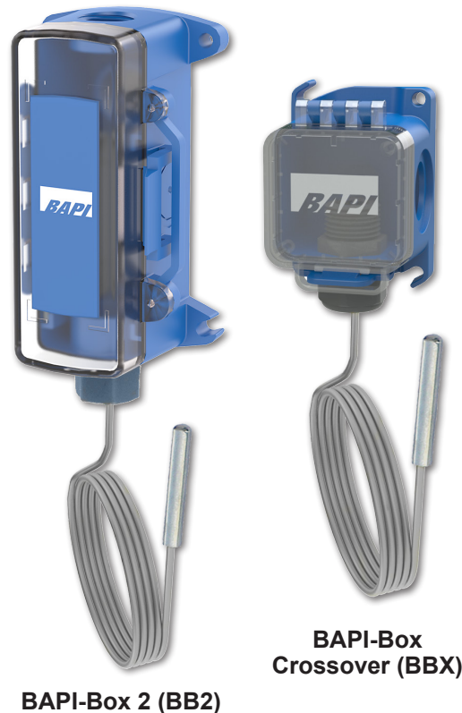
BAPI-Box 2 (BB2)