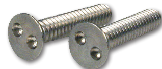
Spanner Security Screws