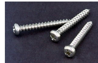
Pan Head Screws