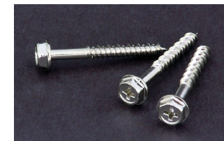
Hex Head Screws