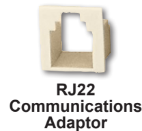
RJ22 Communications Adaptor