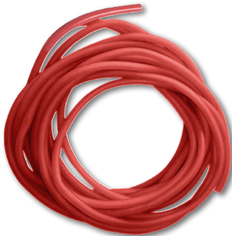
Silicone Rubber Tubing (ZPS-SIL-250-125-50)