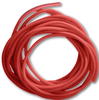
Silicone Rubber Tubing (ZPS-SIL-250-125-50)