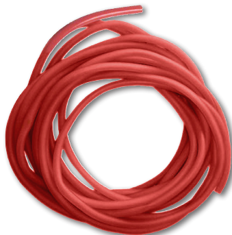
Silicone Rubber Tubing (ZPS-SIL-250-125-50)