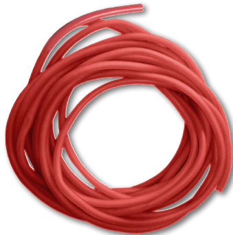
Silicone Rubber Tubing (ZPS-SIL-250-125-50)