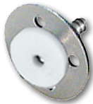
Static Probe Only, Zero Depth (ZPS-ACC22)