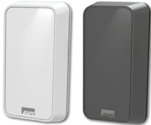
BAPI-Stat “Quantum Slim” Sensors

The new BAPI-Stat “Quantum Slim” Temperature Room Sensor is designed for applications where a temperature output is required with a sleek, low profile room enclosure. Available with thermistor and RTD elements. Ideal for locations where aesthetics are as important as the temperature measurement.