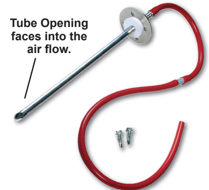
Total Pressure Probe Assembly