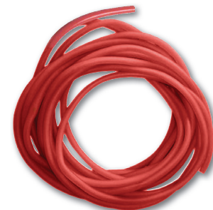
Silicone Rubber Tubing