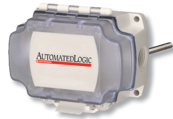
Wireless Duct Temperature Transmitter

Wireless Duct Temperature Transmitters feature medical-grade closed cell foam to seal the probe insertion hole and to absorb vibration. Mounting feet allow for easy installation directly to the wall of the duct. The Duct Units come with etched teflon leadwires, double encapsulated sensors and a watertight BAPI-Box enclosure to withstand high humidity and condensation and perform under real world conditions. The units are available with probe lengths from 4" to 18" to accommodate most duct shapes and sizes. Custom probe lengths are also available.