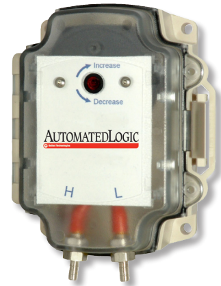
Differential Pressure Switch

The unit also features an extremely high proof pressure of 100" W.C. so that it will continue to function properly even if it is accidentally connected to an unusually high or low pressure.