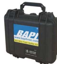
Kit Carrying Case (Included)