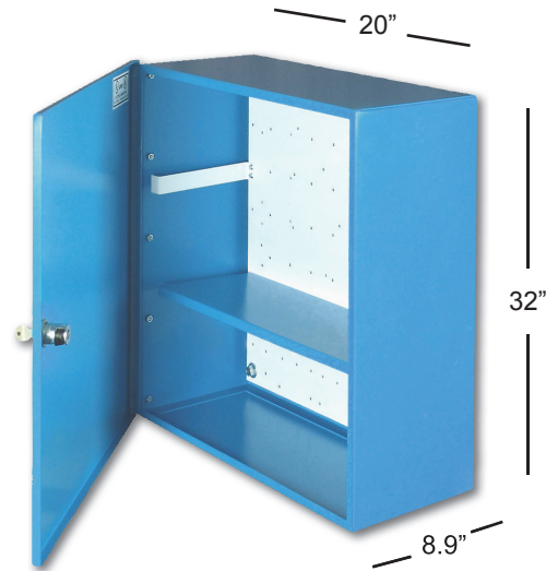
32208N1S - Steel Enclosure 32x20x8

Each BAPI enclosure is UL50 rated and carries a UL sticker. Enclosures are suitable for use in UL508 panels.