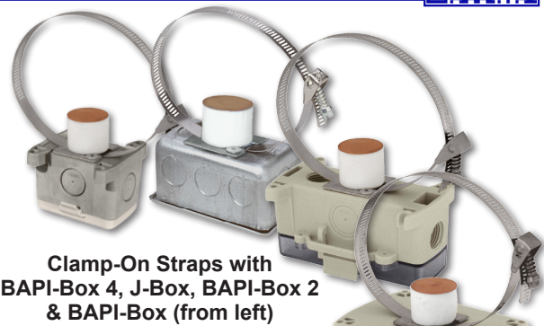
Clamp-On Straps with BAPI-Box 4, J-Box, BAPI-Box 2 & BAPI-Box (from left)

(See pg A56 for more Remote Probe Options.)