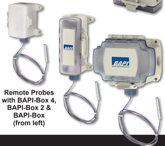
Remote Probes with BAPI-Box 4, BAPI-Box 2 & BAPI-Box (from left)