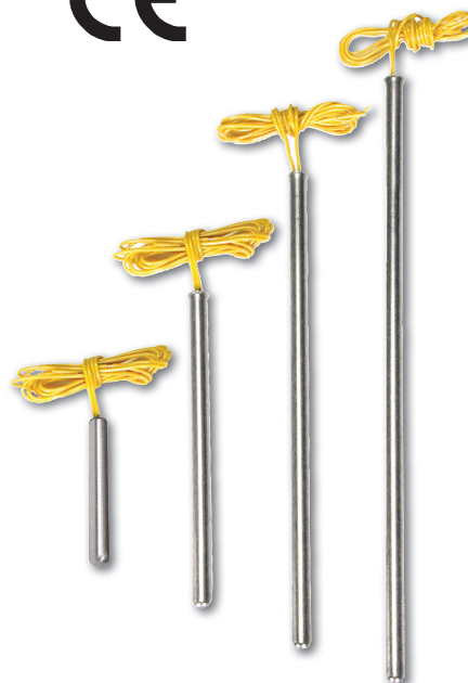
Replacement Probes 1.75", 4.5", 6.5" & 8.25" Probes with Etched Teflon Leads (The 1.75" Probe is "No Flare" while the other three are "Flared")

*All Passive Thermistors 20KΩ and smaller are CE compliant.