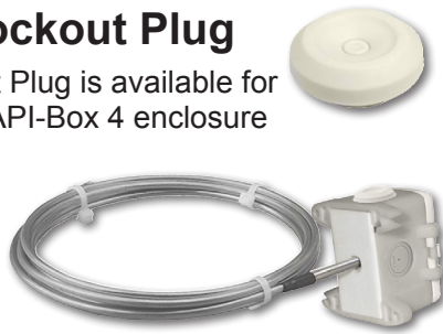
BAPI-Box 4 Duct Averaging Sensor with Plug Installed

A Pierceable Knockout Plug is available for the open port in the BAPI-Box 4 enclosure (and for other enclosures). With the plug installed, the BAPI-Box 4 carries an IP44 rating. See "Accessories" for more info.