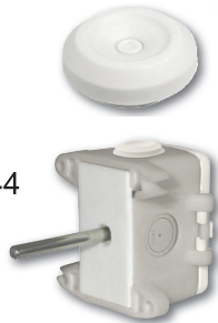
BAPI-Box 4 Duct Sensor with Plug Installed

A Pierceable Knockout Plug is available for the open hole in the BAPI-Box 4 enclosure (and for ports in other enclosures). With the plug installed, the BAPI-Box 4 carries an IP44 rating. See "Accessories" for more info.