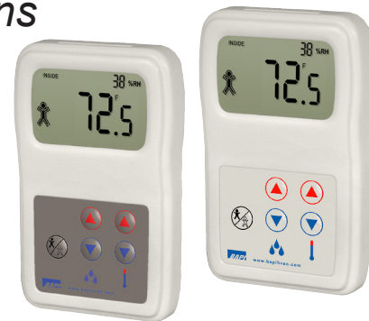
BAPI-Stat 3 Units with Gray Keypad and Off White Keypad

The BAPI-Stat 3 is designed for operating rooms, clean rooms and elder care facilities. It features an easy-to-read display and membrane pushbuttons for wipedown cleaning. It is available as a temperature sensor alone or as a combination temp./humidity sensor. Depending upon the options selected, the BAPI-Stat can display room temp., room humidity, temp. setpoint, humidity setpoint and override status.