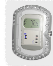
BAPI-Guard Mounted Over a Thermostat