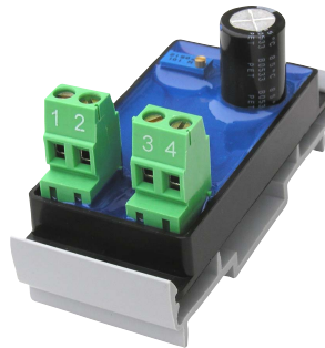
VC350 with optional Snaptrack