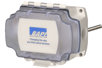
Wireless Duct Temperature Transmitter

BAPI Wireless Duct Temperature Transmitters feature closed cell foam to seal the probe insertion hole and to absorb vibration. Mounting feet allow for easy installation directly to the wall of the duct. The Duct Units come with etched teflon leadwires, double encapsulated sensors and a watertight BAPI-Box enclosure to withstand high humidity and condensation and perform under real world conditions. The units are available with probe lengths from 4" to 18" to accommodate most duct shapes and sizes. Custom probe lengths are also available.