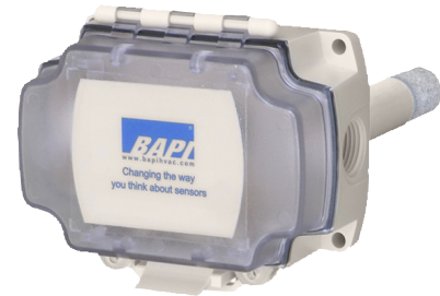
Wireless Duct Temperature and Humidity Transmitter

BAPI Wireless Duct Temp. and Humidity Transmitters feature closed cell foam to seal the probe insertion hole and to absorb vibration. Mounting feet allow for easy installation directly to the wall of the duct. The wireless Duct Units come with a watertight BAPI-Box enclosure to withstand high humidity and condensation and perform under real world conditions.