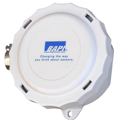
Carbon Monoxide Sensor without Display