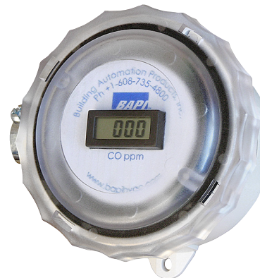
Carbon Monoxide Sensor with Display

BAPI's Carbon Monoxide Sensor offers enhanced, long life electrochemical sensing with outstanding accuracy at low concentrations. The sensor has a range of 1-100 PPM or 1-300 PPM of Carbon Monoxide with a resolution of 1 PPM and a linear output of 4-20 mA. The unit also features a robust enclosure and is available with or without LCD display.