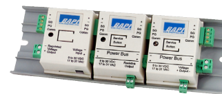
Washdown Wall Plate Power Supply with two Output Modules

A Washdown Wall Plate Power Supply provides power to the Wall Plate as well as to the Analog Output Modules which convert the temperature and humidity data from the Wall Plate into a resistance, voltage or current signal for the DDC controller. One Power Supply can support up to 15 Wall Plates and 30 Output Modules. The optional Direct Temperature Sensor doesn't require an Analog Output Module. See the next 4 pages for more info on the Power Supply and Output Modules.