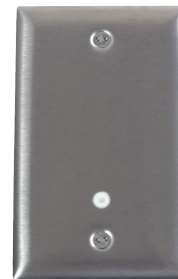
Washdown Wall Plate Unit

The Washdown Wall Plate Unit is available as a humidity sensor alone or as a combination temperature and humidity sensor. The 304 stainless steel plate and sensor are watertight for washdown or wipedown areas. A 1/8" closed cell foam pad insulates the sensors from the wall temperature and seals the wall to prevent air leaks.